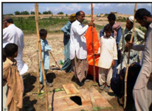
WaterAid workers help to make temporary latrines

“Our Pakistan country programme is monitoring the situation on the ground and is in discussion with partners regarding the possibility of further interventions. We are in close touch with our staff and partners in Pakistan and they will be continuously assessing what contribution WaterAid can usefully make to the relief effort, through supporting the work of the national authorities and international disaster relief agencies in the area.”