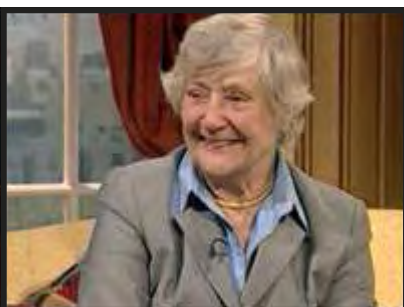
Baroness Shirley Williams

The UK Churches' campaign, entitled Now is the Time, joins the World Council of Churches and others in pressing for governments to put all bomb-grade material under international control and commit to making the use and possession of nuclear weapons illegal through a new Nuclear Weapons Convention. They are asking people to sign an online petition expressing support for these aims.